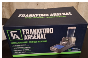
Magnetospeed v3 Chronograph $300