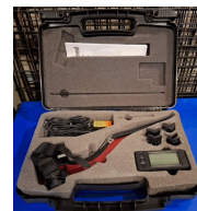
Frankfords Arsenal Chronographs $150