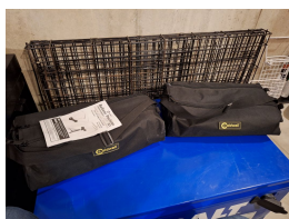
Caudell Precision Chronographs $100 each