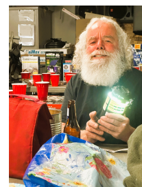
One hour later, "Voilà"