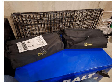
Cauldell Precision Chronographs $100 each