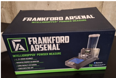
Magnetospeed v3 Chronograph $300