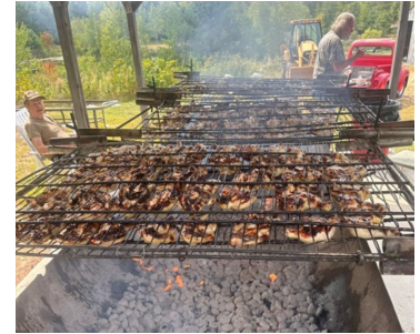
Bill Lane supervising the cooking of the chicken, while Fred Plante supervised Bill