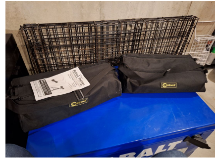
Cauldell Precision Chronographs $100 each