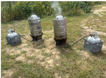
Ears of corn cooking