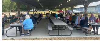
Group waiting on the food