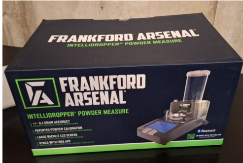
Magnetspeed v3 Chronograph $300