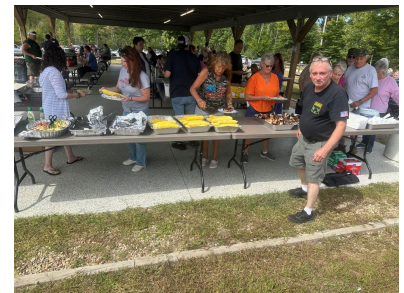
Food all on display